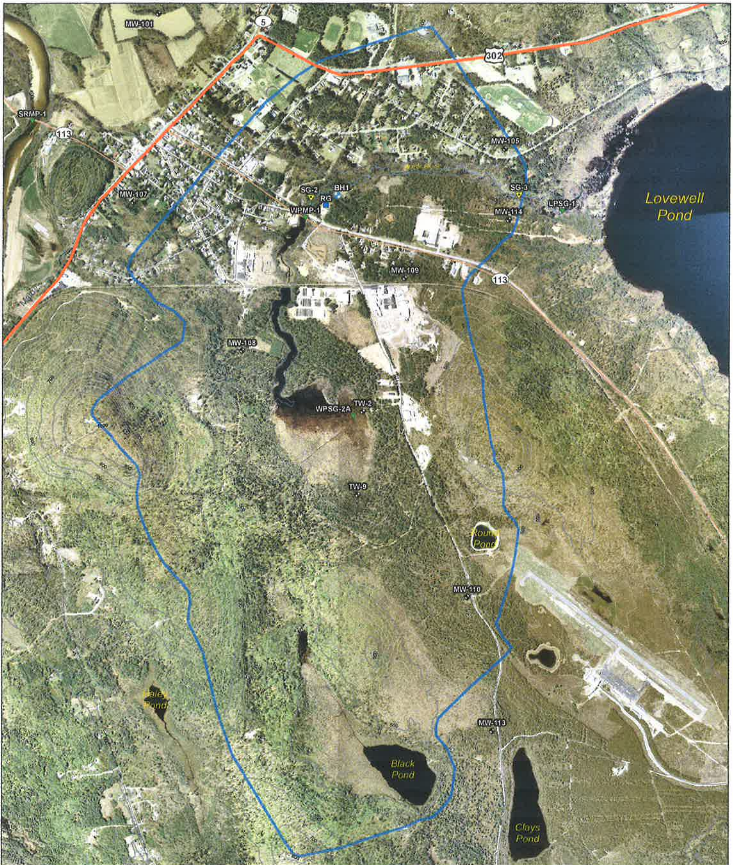
FIGURE 1 MONITORING LOCATIONS EVERGREEN SPRING FRYEBURG, MAINE