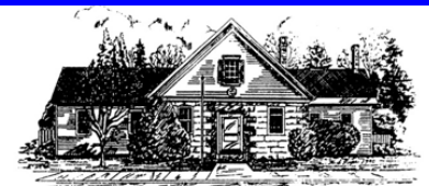
Fryeburg Public Library Card

It's National Library Card Sign-up Month!